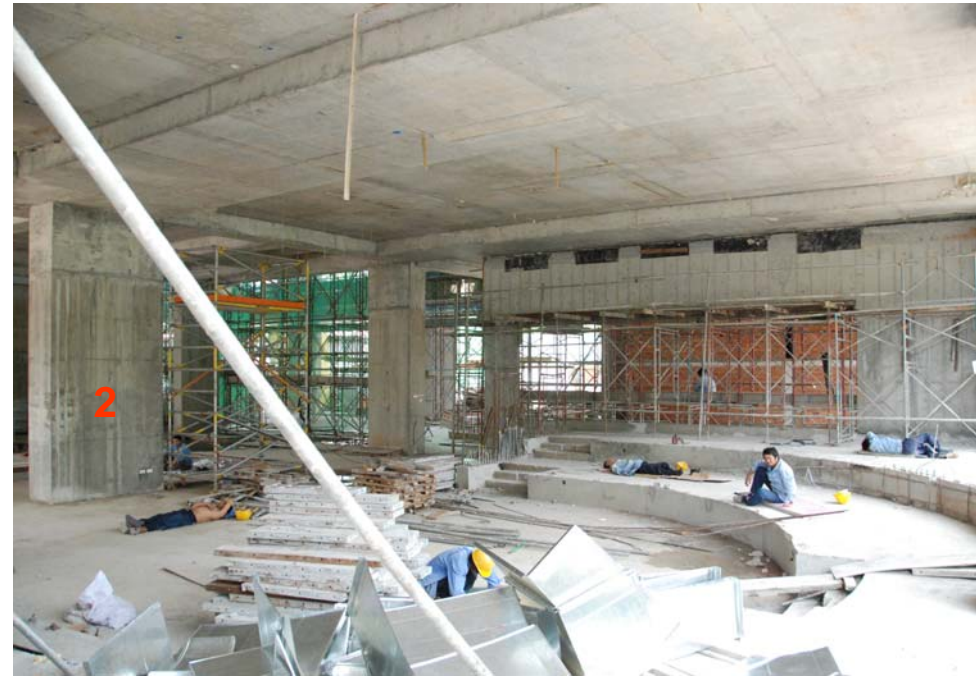
Large Teaching Room