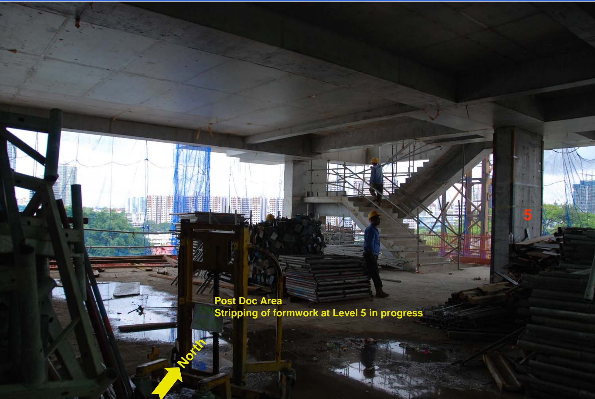
Post Doc Area Stripping of formwork at Level 5 in progress