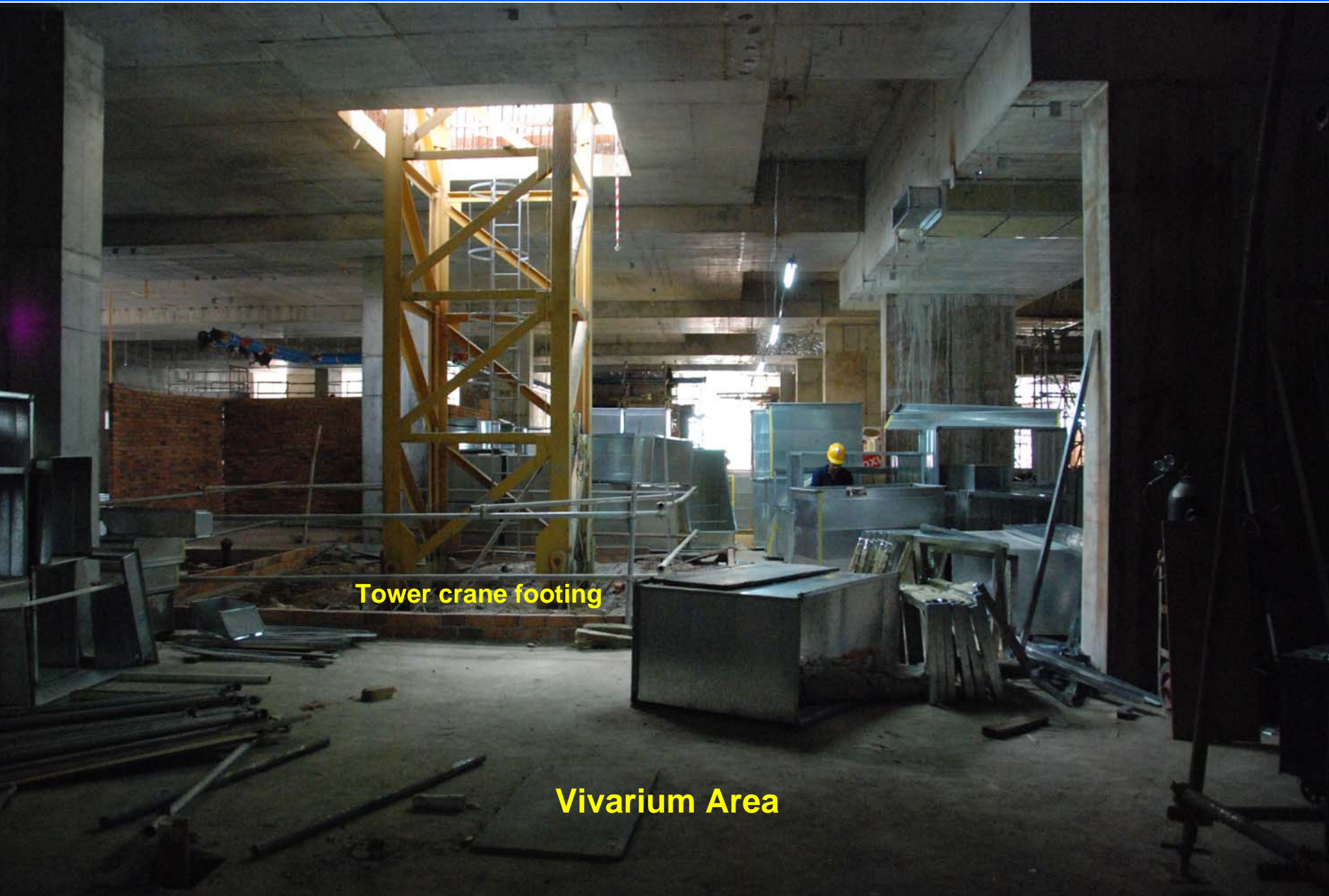
Tower crane footing