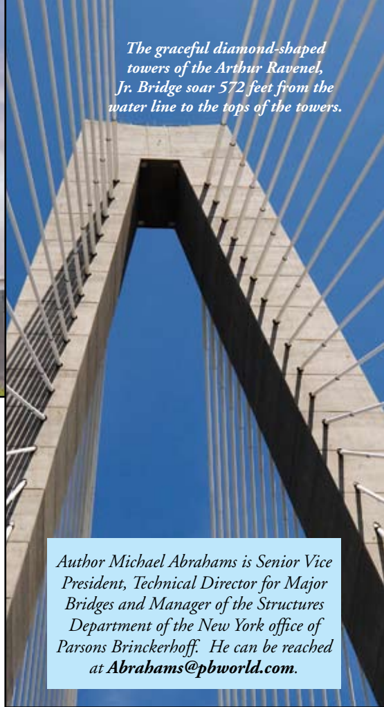
The graceful diamond-shaped towers of the Arthur Ravenel, Jr. Bridge soar 572 feet from the water line to the tops of the towers.